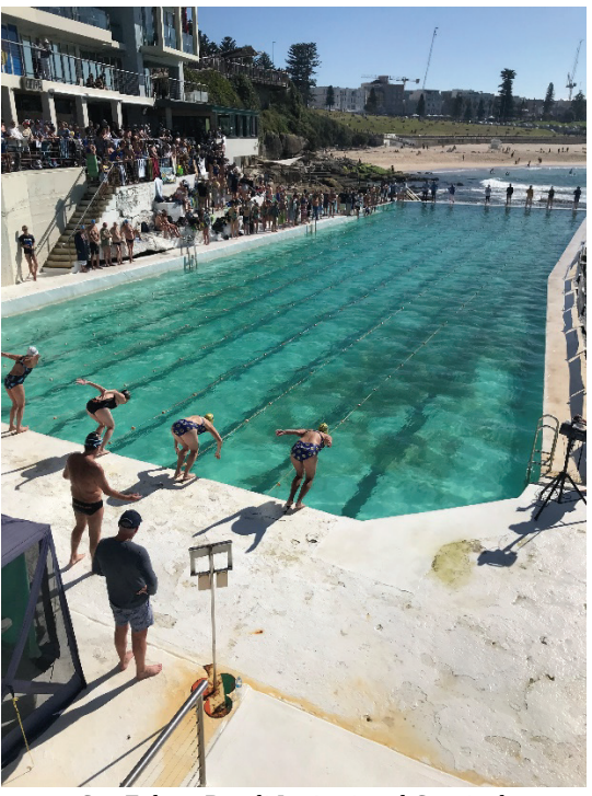
Sea Eels at Bondi Invitational Carnival Bondi Icebergs Pool