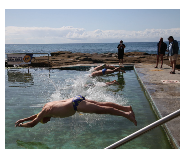
Sea Eels Championships Coalcliff pool