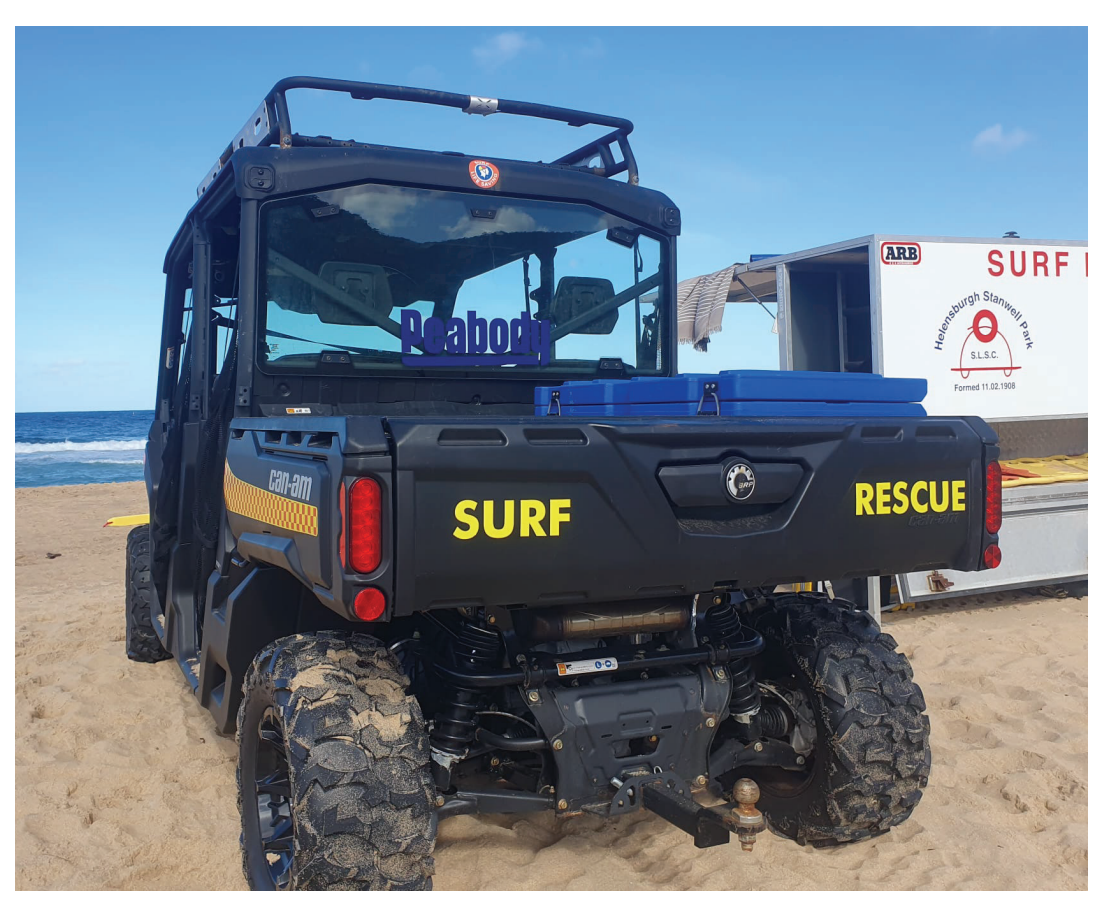
Peabody (Metropolitan Collieries) contributed towards the acquisition of a new ATV during the 2023-24 year. To meet the total cost, the annual $10,000 Australian Government Beach Safety Equipment Grant was used together with donations from Surf Life Saving NSW and other donors.

At 31 March 2024, the Club was not in debt to any supplier, other than within 30 day trading terms.