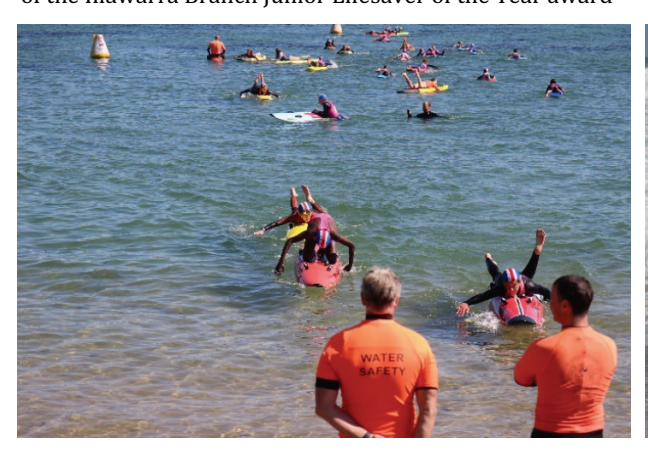
Skills Day at Bundeena