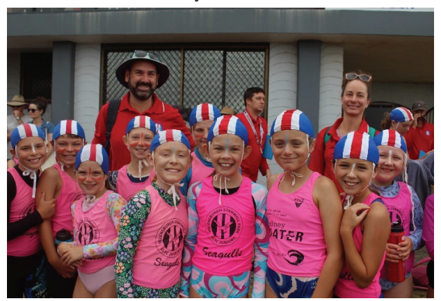
Carl Williams Cup Day