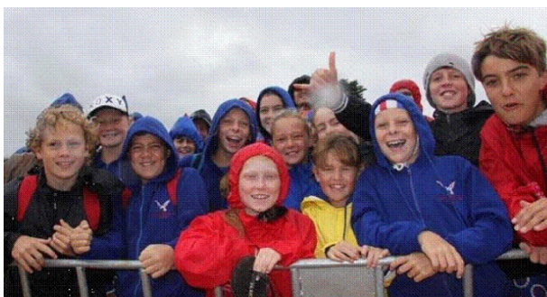
Vocal Juniors supporters at this seasons NSW Age Championships. The weather was absolutely horrendous for the event though spirits were high amongst HSP members

Again the club was extremely successful on the beach at carnivals. Our all age relay continued to dominate the branch championships with 1 st and 3 rd . We also had podium finishes in almost all age groups in sprints, flags and relays. This clearly shows the breadth and depth of our beach competitors and the success of our beach training program.