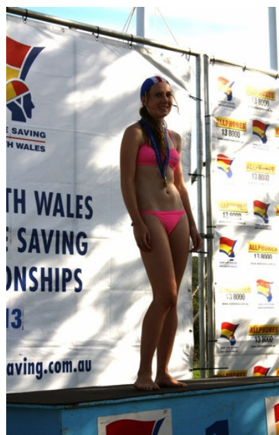
Illawarra Awards of Excellence