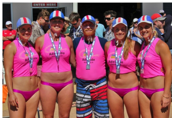
The girls at Worlds claiming Silver in the Open Womens Sufboat event at Christies Beach, South Australia