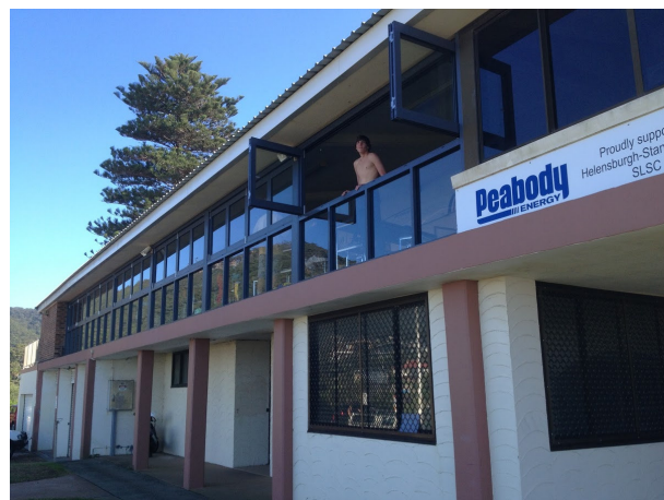
The brand new windows looking the goods. How good are they!