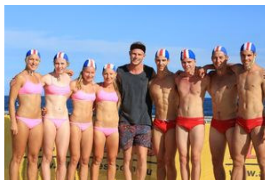
Illawarra Awards of Excellence

Source: www.surflifesaving.com.au - Tue 12 Mar 2013