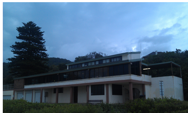
The old surf club windows

The remaining funding will be sourced from the clubs building fund.