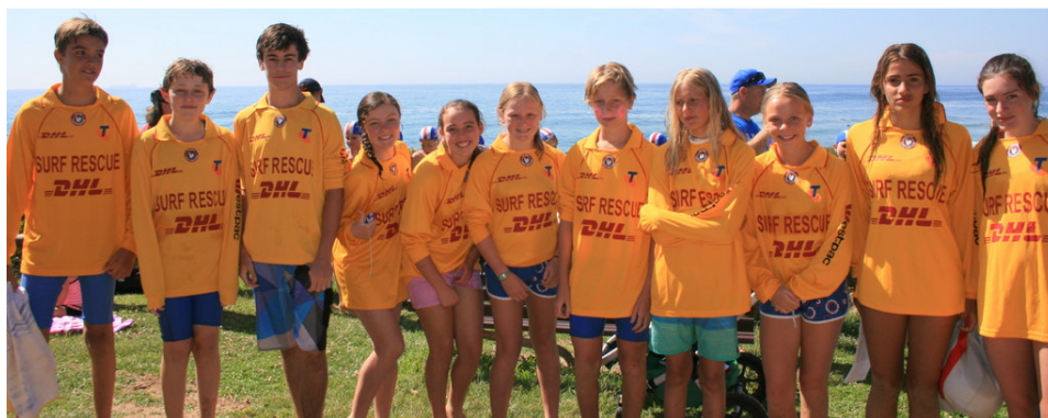
This years latest crop of SRCs parading their newly acquired patrol uniforms. Congrats to all members who upskilled and received an award