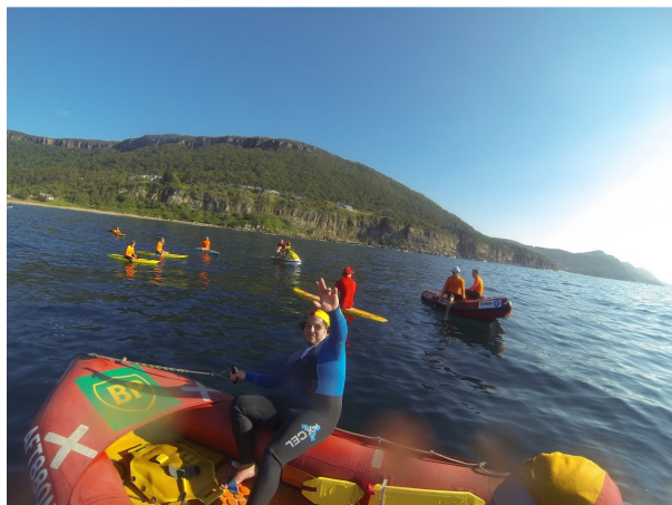
Ripper day on the water for the 2013 Ocean Swim Challenge. Large number of club members available for water safety which didn't go unnoticed. Cheers!